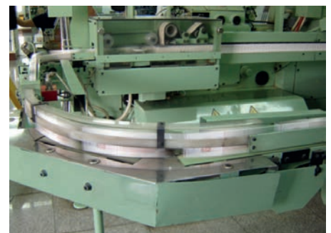
Transmission belts running at high speeds.