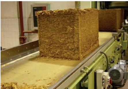
A - B Conveyance of tobacco bundles. VERNA 20PF.

To detect the presence of these elements, a pyrolysis test is carried out, in which a belt sample is subjected to combustion ( 810° C ). In the gas produced, the percentage in weight of the above elements is analysed.