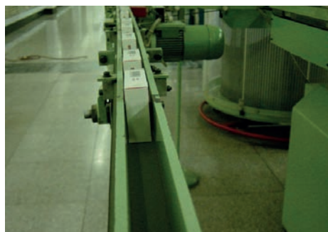
Transmission belts at the cigarette manufacturing and wrapping.