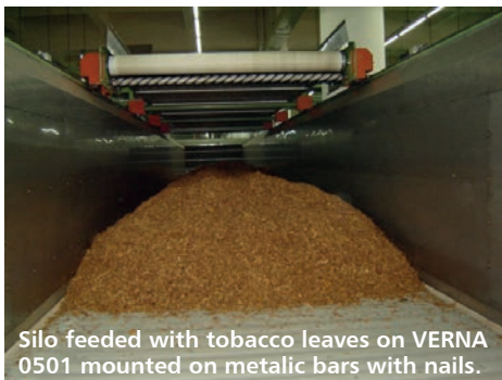
Silo feeded with tobacco leaves on VERNA 0501 mounted on metallic bars with nails.