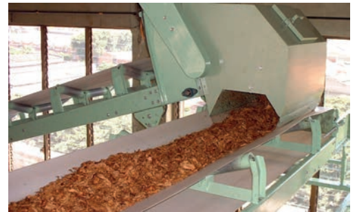
E - Flat conveyors: VERNA 12PF - VERNA 20PF - VERNA 30PF.