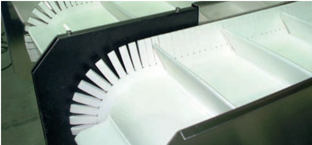
White PVC belt with longitudinal cut profiles.