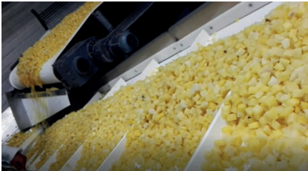
CLINA S20UFMT with transverse cleats conveying potatoes.

Packaging - PVC belts with type Q, G2, D top cover pattern. Thermoweldable extruded belts for canning process.