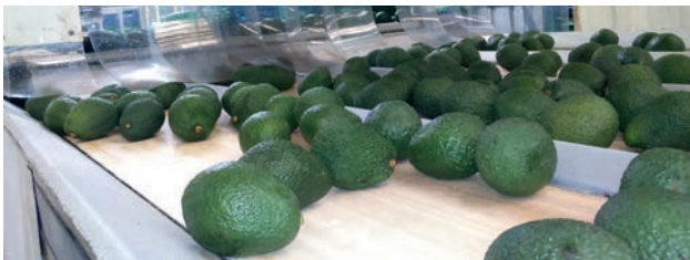
FEBOR 12CF WH conveying avocados.