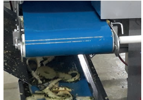
NOVAK S09UF and NOVAK 20CK conveying pineapple residue.