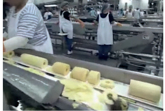
Conveying of cut pineapples on ESPOT belt with sealed edges.