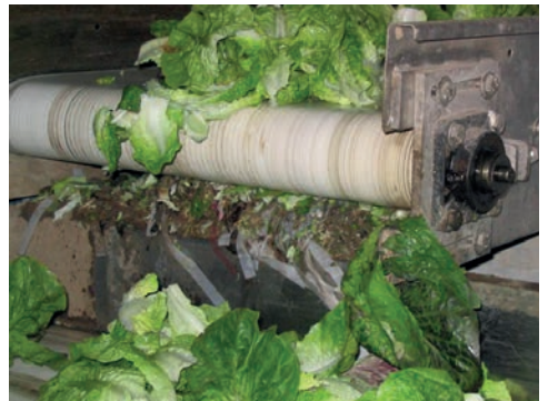
CLINA 20CK conveying lettuce.