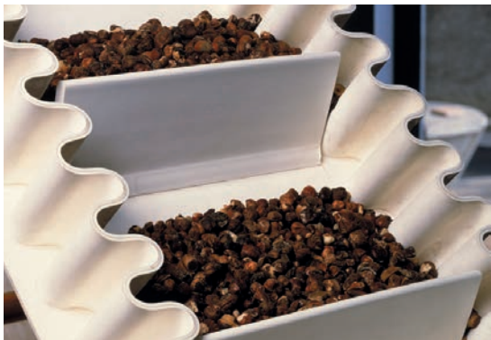
CLINA belt with Runer and transverse cleats on an inclined conveyor for hazelnuts.