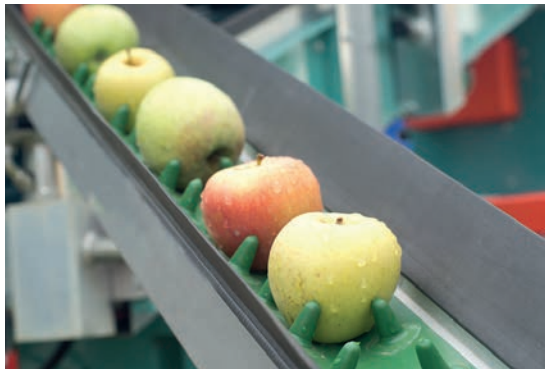
Special short finger profiles on a harvesting machine for thin skinned fruits (apple).