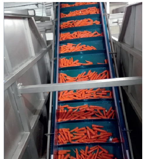
FEBOR 19CK on inclined conveyer with transverse cleats for carrots.