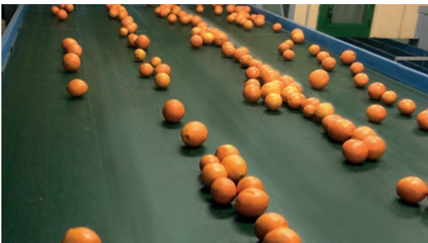
FEBOR 12GF-GR_EU conveying oranges.