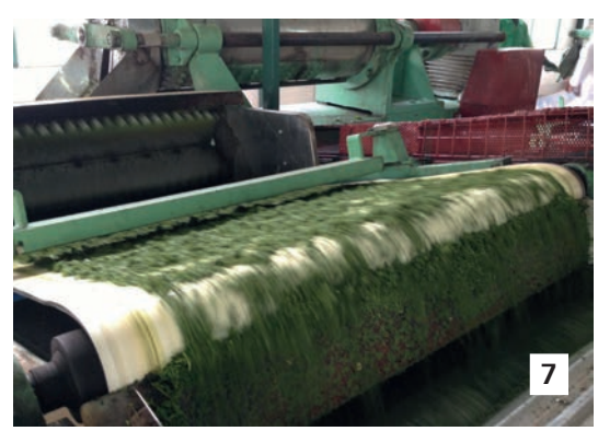
6 to 9. C.T.C. Belt Clina 20CK with bottom tracking guides NE.B11-62.

During C.T.C. phase aggresive juices are in contact with the belt: Clina 20CK (1.5mm thick top cover ) or Clina 2035 (1.2mm thick ).