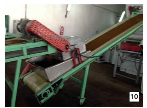
10 to 12. After fermentation the brown tea is transferred to the Dryer on a Clina 20CK/Clina 21CK, Clina 2035, Clina 12CF or Clina 20CF belt.

13. After dryer to sorting: Clina 10FF and 16FF.