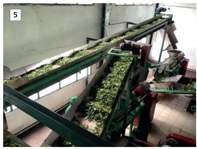
5. Incline conveyor from lines 1 and 2 to C.T.C. belt (Clina 12CF).