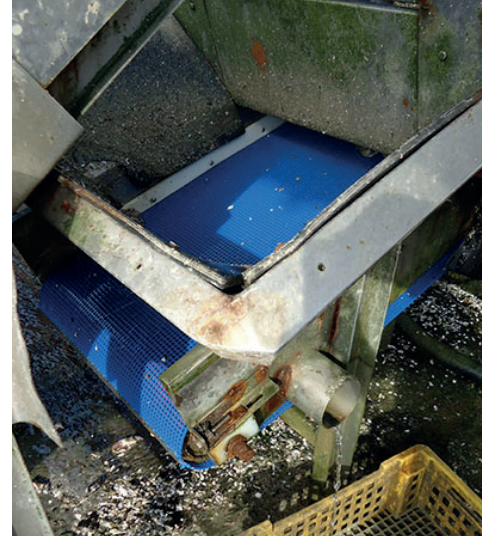
esbelt WASHFLOW belt

Dirt, soil and stones that have to be separated from the product get stuck in the holes in modular belts.