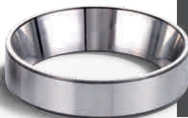
Superfinished raceway mirror effect